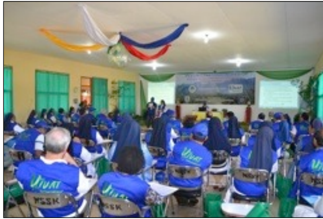
Participants of the workshop VIVAT International, Indonesia

On September 24 –29, 2012 VIVAT International held a workshop for its members in Indonesia and Timor Leste at the Retreat House of Siloam in Kuwu, West Flores – Indonesia. The workshop was attended by 80 participants mostly coming from the islands of Kalimantan, Sumatra, Jawa, Flores, West Timor, West Papua and Timor Leste. Aside from VIVAT Indonesia members, other participants were a few diocesan priests, laywomen and men as JPIC co-workers at the grassroots level.